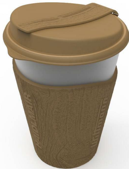
Fig. 1: Re-usable coffee-to-go cups in 3-component technology