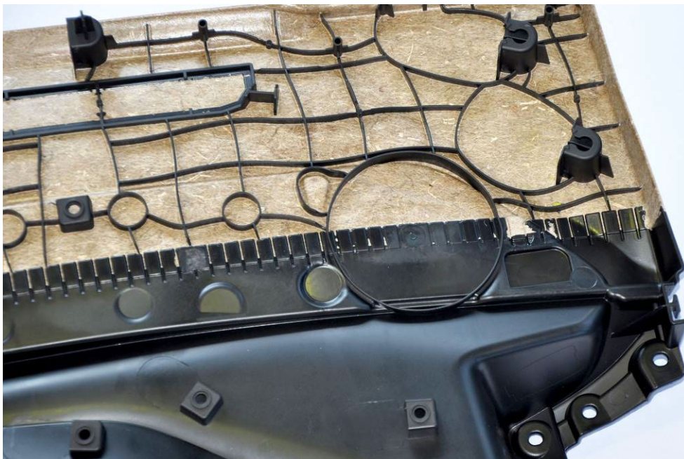
Fig. 4: Indoor panel made of a natural fiber mat and recyclates, produced on a MacroPower 1100 with a mold supplied by FRIMO