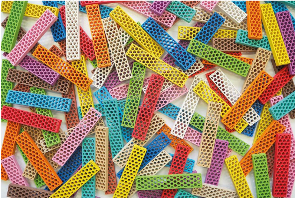
Fig. 3: Bio building blocks made of Fasal