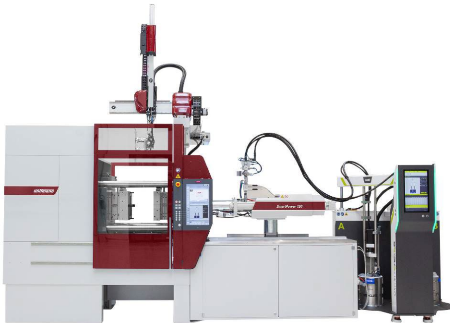
Fig. 6: SmartPower 120/350 LIM with Nexus X200 metering unit