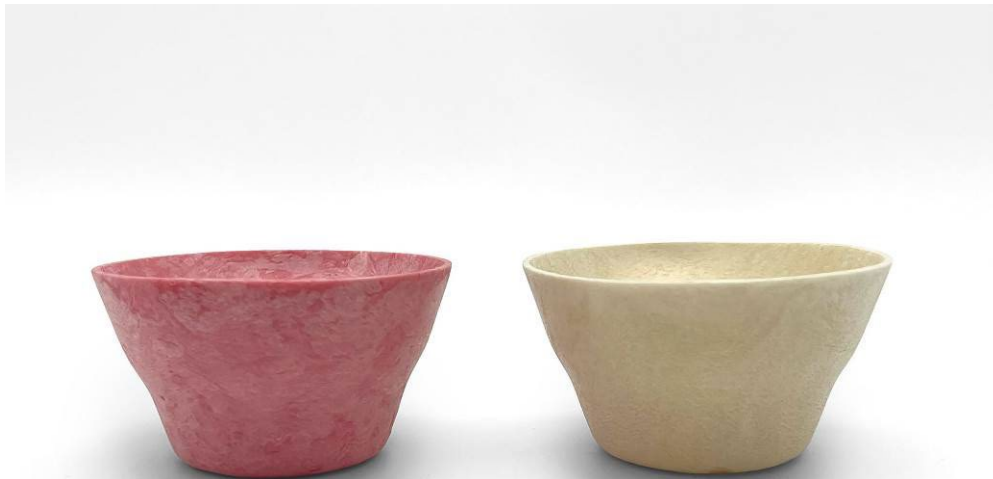
Fig. 2: Biodegradable ice-cream cup made of BAOPAP